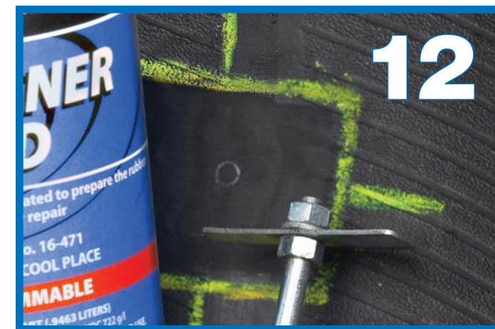
12 12. Apply a light coat of cleaner fluid to the buffed area, scrape clean and allow to dry.