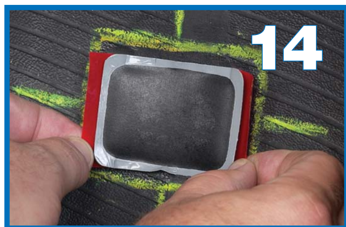
14 14. When cement is dry, partially remove the poly backing from the repair unit, leaving just enough to hold the unit. Press the unit into place while removing the rest of the backing.