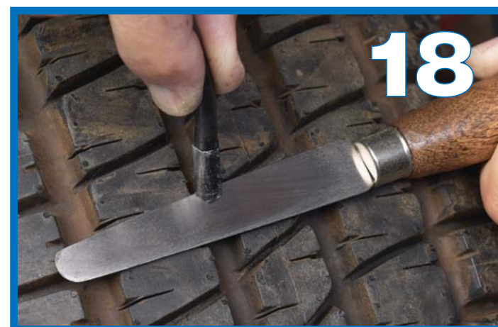
18 18. After inflating, cut the plug stem flush with the outside tread area. The tire is now ready to be returned to service.