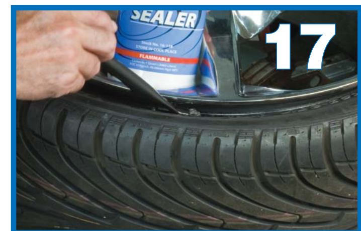
17 17. Apply bead sealer to the bead of the tire before inflation to help prevent air loss around the bead. (NOT NECESSARY FOR TRUCK TIRES.)