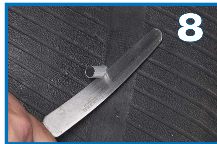
8 8. Using a flexible knife, cut the plug on the inside of the tire 1/8-inch above the innerliner. Be careful not to stretch the plug when cutting.