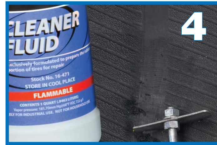
4 4. Clean the area around the injury with cleaner fluid and a scraper.