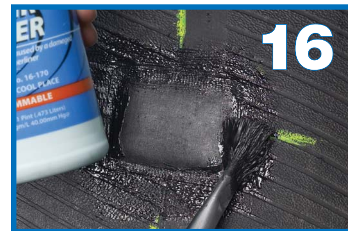
16 16. Apply repair sealer on the overbuff area, and over the edge of the repair unit.