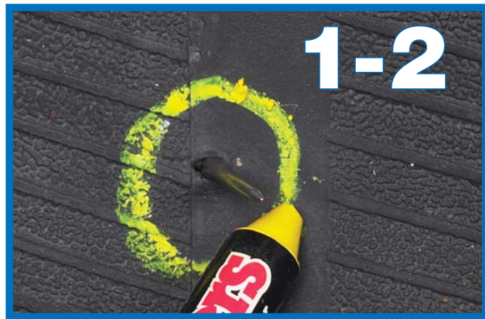
1-2 1. Consult information about repairability of tires. 2. Locate the injury and circle with a tire crayon. DO NOT INVERT RADIAL TIRES.

The following “how to” photos and captions show and explain accepted industry procedures for repairing tire puncture injuries. Additional information is available on RMA’s website – rma.org – and by requesting its Puncture Repair Procedures information, or by requesting information about TIA’s Basic Automotive Tire Service training series, which includes a module dedicated to puncture repair.