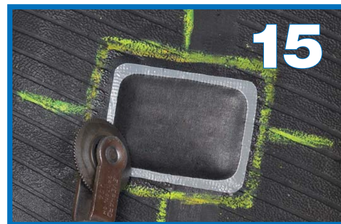
15 15. Stitch the repair unit vigorously from the center working outwardly. Use as much hand pressure as possible. Remove top cover film.