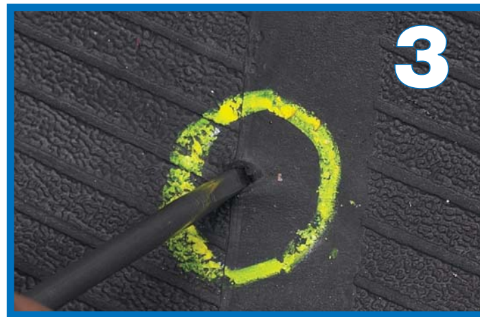
3 3. Remove the foreign puncturing object and probe the injury with an awl to determine the angle of penetration.