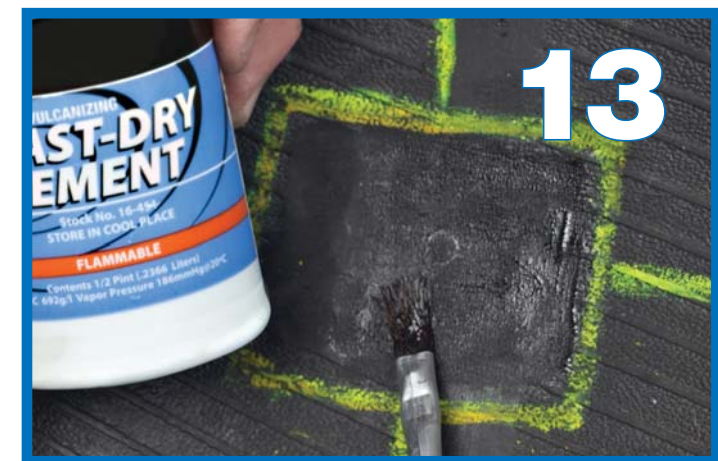
13 13. Apply an even coat of self-vulcanizing cement to the entire buffed area. Allow cement to dry until tacky. Never use blow dryers, compressed air or heat lamps to facilitate drying. Drying time is affected by temperature and humidity.