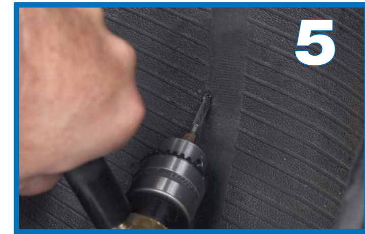
5 5. Using a low speed drill (max. 500-700 rpm) and a 3/16-inch tapered carbide cutter, ream the injury following the angle of penetration from the inside of the tire. Use proper eye protection.