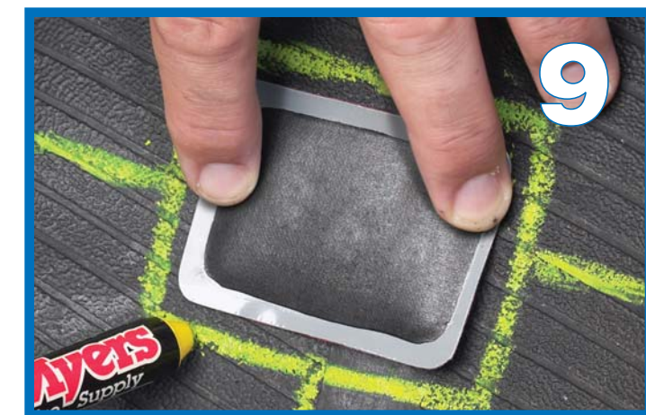
9 9. Making sure the bead arrows of the repair unit are pointing to the beads, center the proper size repair unit over the injury. Use a tire crayon and outline an area 1/2-inch larger than the repair unit.