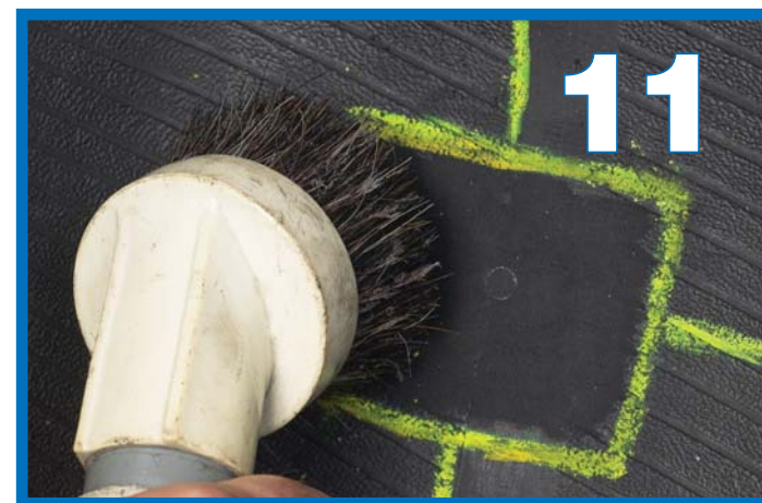
11 11. Use a vacuum to completely remove the buffing dust.