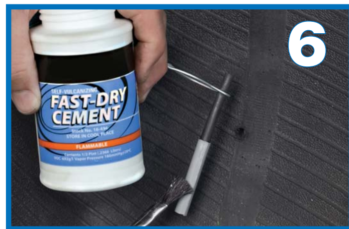
6 6. Remove the poly from the plug stem. Hook the stem into the wire puller. Coat the entire plug with self-vulcanizing cement. NOTE: With one-piece repair units the patch section must be coated, as well.